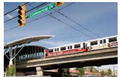
The SkyTrain is on our doorstep!

This new Seniors Housing offers intimate, well designed, comfortable and affordable living for seniors. Located near Commercial Drive, near parks and recreation facilities, near public transportation and within a "walkable" community. You will not find a better setting for seniors who want to enjoy the benefits of the "total community". Right on our doorstep!